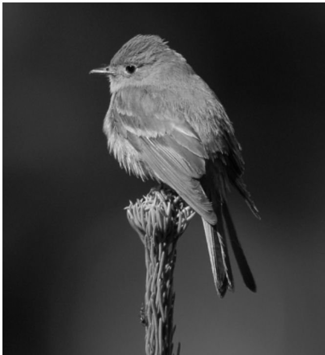
Hammond's Flycatcher at Yuba Pass, CA.