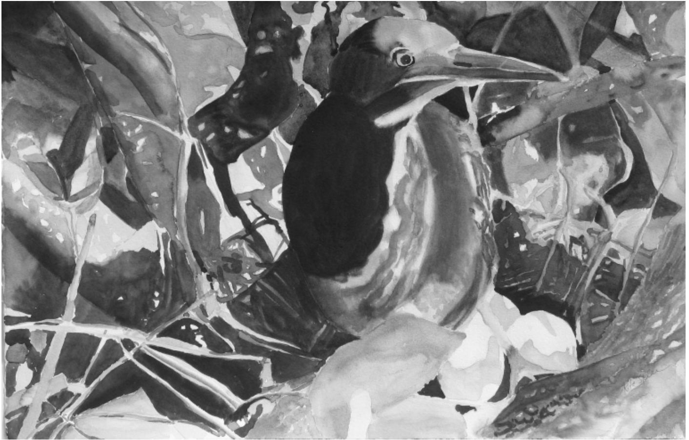
Green Heron with Eggs. Original Watercolor by Rita Sklar

Visit the artist's web site at www.ritasklar.com .