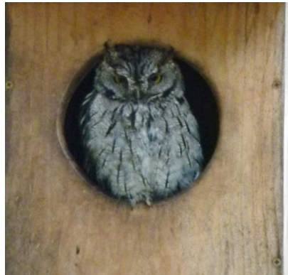
Western Screech Owl