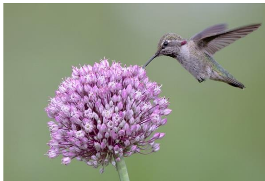
Annas Hummingbird

Audubon has launched a program called Hummingbirds at Home . The goal of this program is to gather data that will help document the hummingbirds' journey and provide a better understanding of how changing flowering patterns and supplemental feeding by people relate to hummingbirds' migration and breeding success, and also climate change.