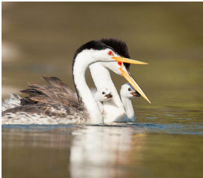
Clark's Grebe Family