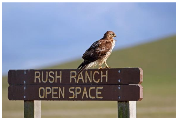
Rush Ranch