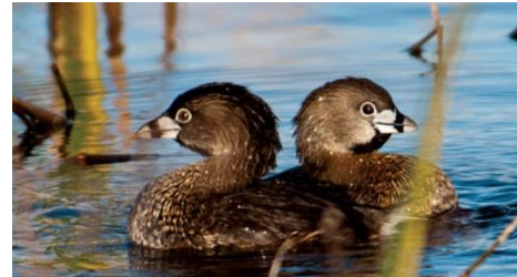
Pied-billed grebe

The Solano County Breeding Bird Atlas is on its way to completion! Over 100 of the 150 breeding species descriptions have been written, and more than 8,000 photos have been submitted by 20 local photographers. From these photos, 300 will be chosen for publication.