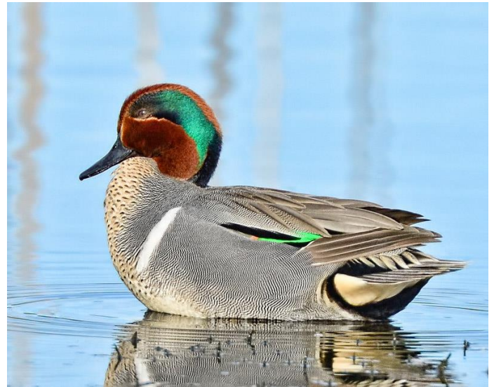
Green-winged Teal

Eucalyptus trees. If the tide is accommodating, we will see shore birds. We may see raptors and perhaps a falcon. We will bird Eucalyptus Drive and the American Canyon Wetlands trail, and then continue to do some pre-bird count scouting at areas to be determined. Directions: Meet at parking lot on the corner of Wetlands Edge Road and Eucalyptus Drive. Bring: Water, comfortable walking shoes, binoculars, and layers.