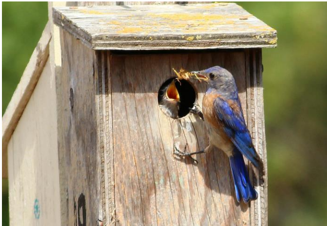
Western bluebird and fledgling

members to participate. Thirteen volunteers took a bluebird monitoring class and were divided into three teams to cover the three bird box trails.