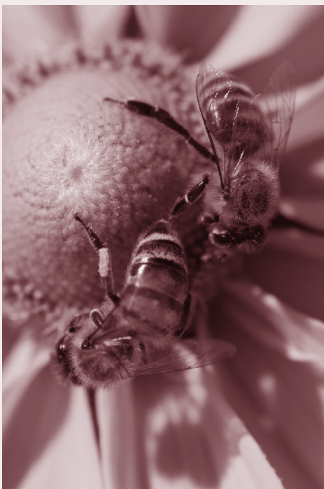
Two bees at a flower.