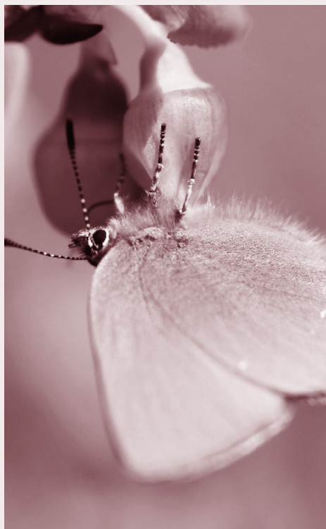
Green hairstreak butterfly.